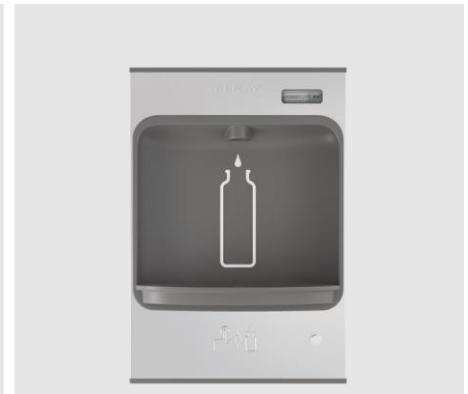
AquaGo 2003 / LMASMB

Features touchless, sensor-activated bottle filler for hygienic hydration and easy hands-free use.